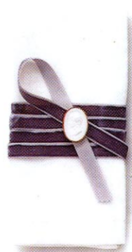
velvet & intaglio