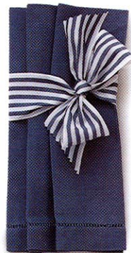
pleats & bows