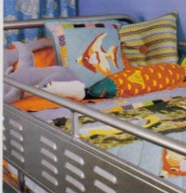
LEFT: Elijah plays with scuba equipment while looking into his new porthole mirror. A curtain featuring sea turtles replaces a standard closet door and incorporates one of Elijah's favorite ocean creatures into the room's design. ABOVE: A mix of colorful fish-theme pillows and bedding bring a youthful look to the left bed and continue the room's ocean theme.